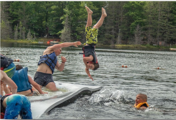
Is this what you hoped for this summer? Many kids did!